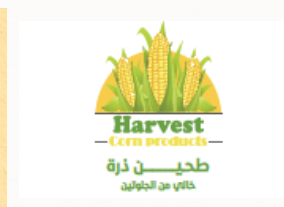
Our Packaging Bags