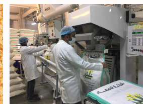
All our machines are supplied by Bühler