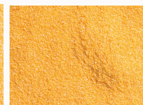
Maize Grits 108