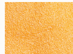
Maize Grits 101

Maize Grits 108: Fine grits made from high quality selected corn origins for direct extruded snacks and breakfast cereals like cornflakes and muesli bars.